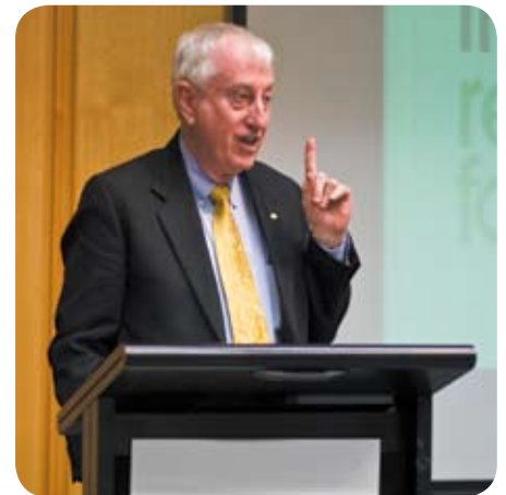
Nobel Laureate for Medicine, Professor Peter Doherty, stresses the importance of independent research institutes at our recent AGM.